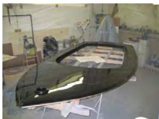
New Classic Cat Deck - PBBS

Over 150 Classic Cats have been sold throughout the US. The success of the design has motivated us to improve where ever and however we could. Many of you have kept up with our changes and have even ordered new spars and the larger sail. Now we are preparing to rebuild the hull with some minor changes that will not affect the overall performance but will certainly enhance the look of the boat. By next summer we will reveal our new hull, fabricated in Rhode Island by a professional fiberglass shop and redesigned on computer by Walter Zesk of ConformLab .